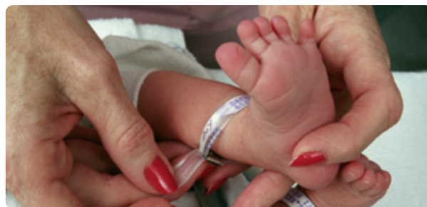
Neonatal / Pediatric Care

Our pioneering cuvette technology means the analyzer never has to be brought near the patient – significantly reducing the risk of spreading infection. Each disposable microcuvette is also individually wrapped to avoid contamination and to offer maximum shelflife.